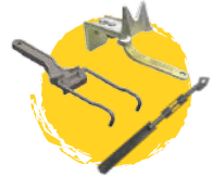
Camlocks, Turnbuckles, & Strongbacks