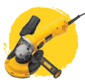
Grinders & Saws