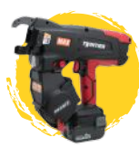
Tie Wire Guns